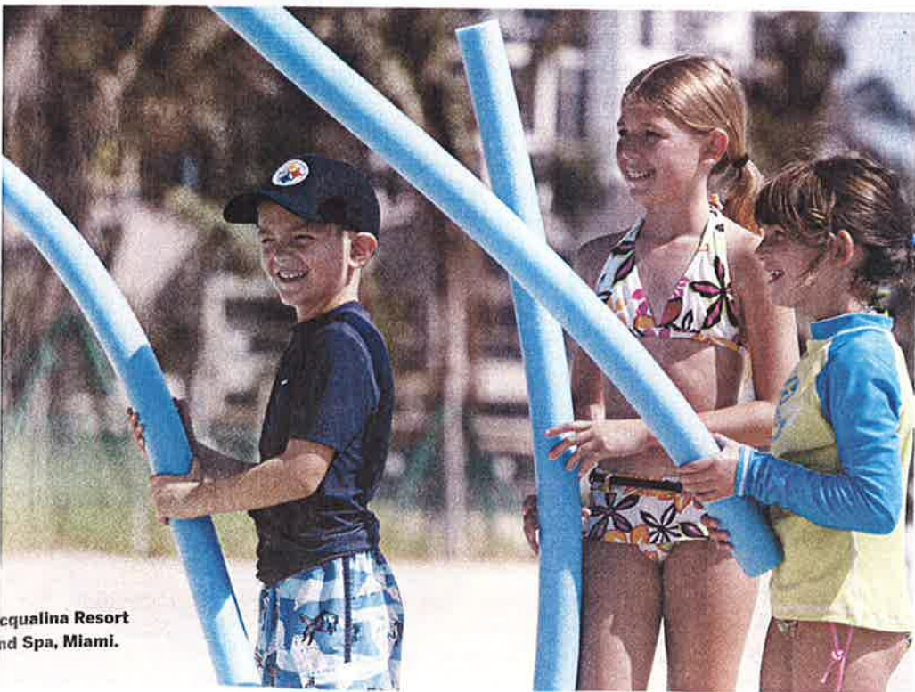
Qualia Resort and Spa, Miami.